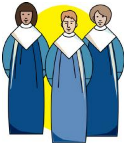
Combined Choir Sunday

The Trinity Choir will be joining with the choirs from our sister Presbyterian Churches of Christ and Holy Way on the three Sundays following Easter. On April 12, the choirs will be singing for