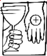
Learn how to eat and drink, all life is in us.