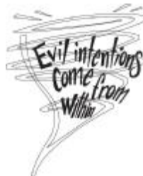
Evil intentions come from within.

Aug 30 - Song of Solomon 2:8- 13; Psalm 45:1-2, 6-9 ; James 1:17- 27 ; Mark 7:1-8, 14-15, 21-23