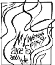
My witness are Spirit and life.