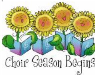
Choir Season Begins