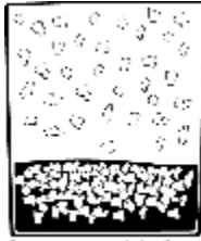
Our ancestors ate manna in the wilderness.