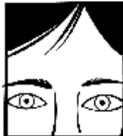
I am the bread of life.